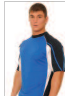
COL A) ROYAL BLUE / NAVY / WHITE