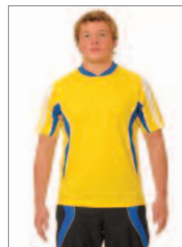
COL A) YELLOW / ROYAL / WHITE