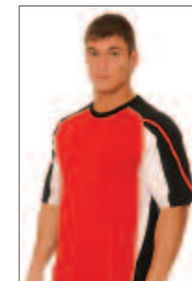
COL G) BLACK / RED / WHITE