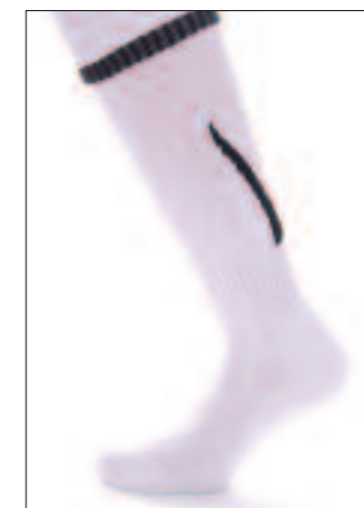
COL F) WHITE / BLACK

Altrincham FC chose a white Teamstar top with white Teamstar shorts and our white football socks for their away kit.