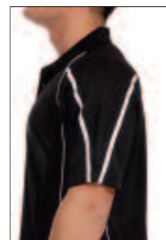
COL B) BLACK / WHITE