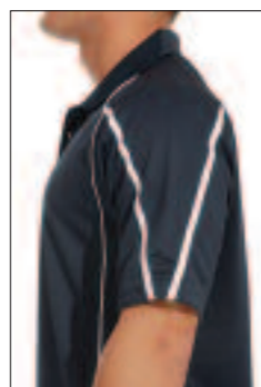
COL A) NAVY / WHITE