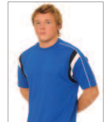
COL F * * ROYAL BLUE / NAVY / WHITE