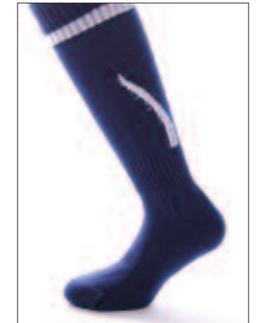
COL C) NAVY / WHITE