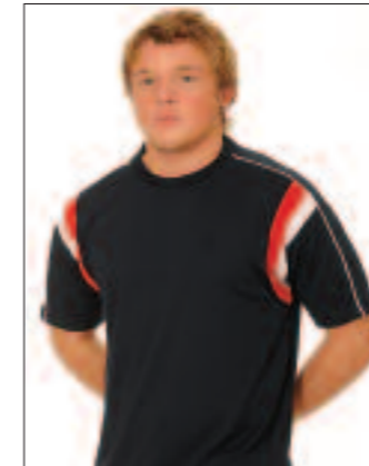
COL A * * * NAVY / RED / WHITE