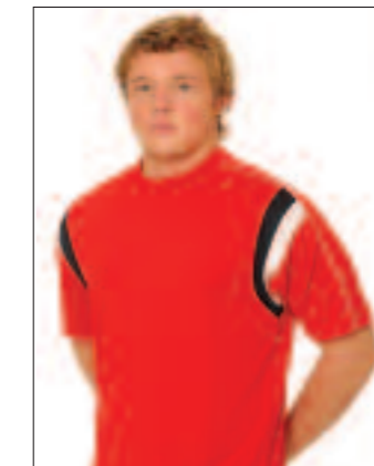
COL E * * RED / NAVY / WHITE