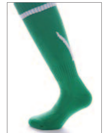
COL E) EMERALD / WHITE