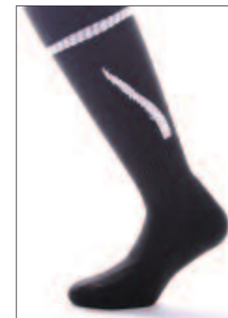
COL D) BLACK / WHITE