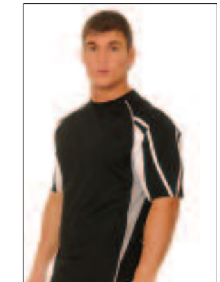
COL D) BLACK / DOVE GREY / WHITE