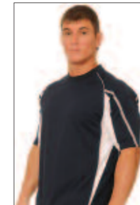
COL C) NAVY / WHITE / DOVE GREY