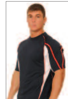
COL B) NAVY / RED / WHITE