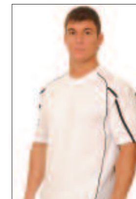
COL F) WHITE / BLACK