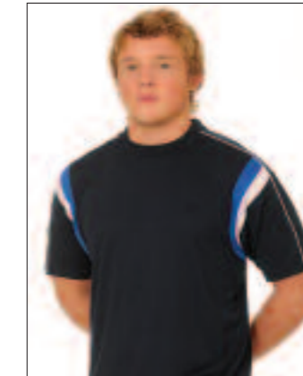
COL B) NAVY / ROYAL BLUE / WHITE