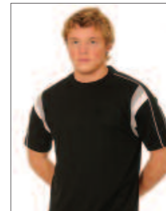
COL D * * * BLACK / DOVE GREY / WHITE