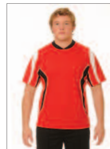
COL B) RED / BLACK / WHITE