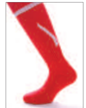
COL G) RED / WHITE