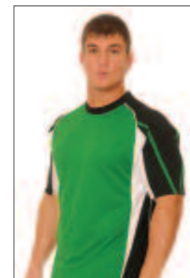
COL E) BLACK / EMERALD / WHITE