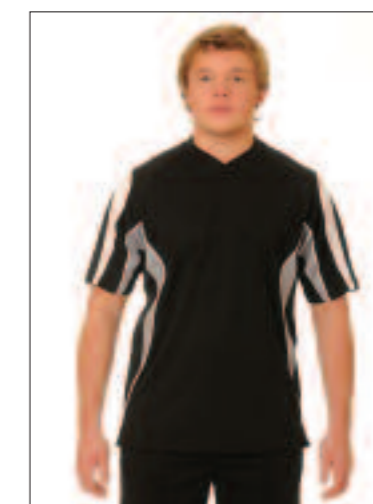
COL C) BLACK / SILVER / WHITE /

Please note: Due to limitations with photography and print processes, colour accuracy cannot be guaranteed.