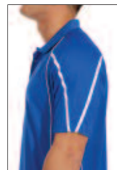
COL C) ROYAL / WHITE