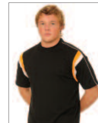
COL H * * BLACK / AMBER / WHITE