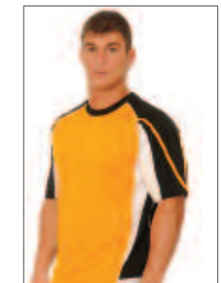
COL H) BLACK / AMBER / WHITE

Please note: Due to limitations with photography and print processes, colour accuracy cannot be guaranteed.