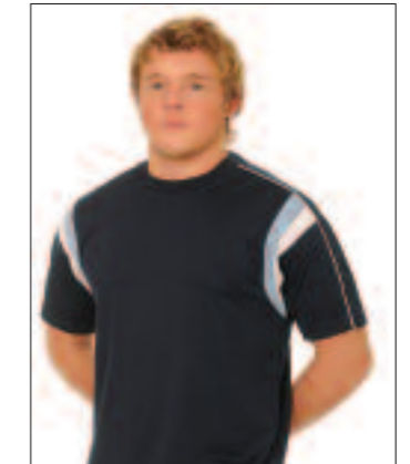
COL C) NAVY / SKY BLUE / WHITE