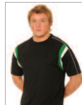
COL G * * * BLACK / EMERALD / WHITE