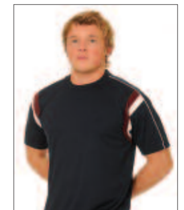
COL I * * * NAVY / MAROON / WHITE